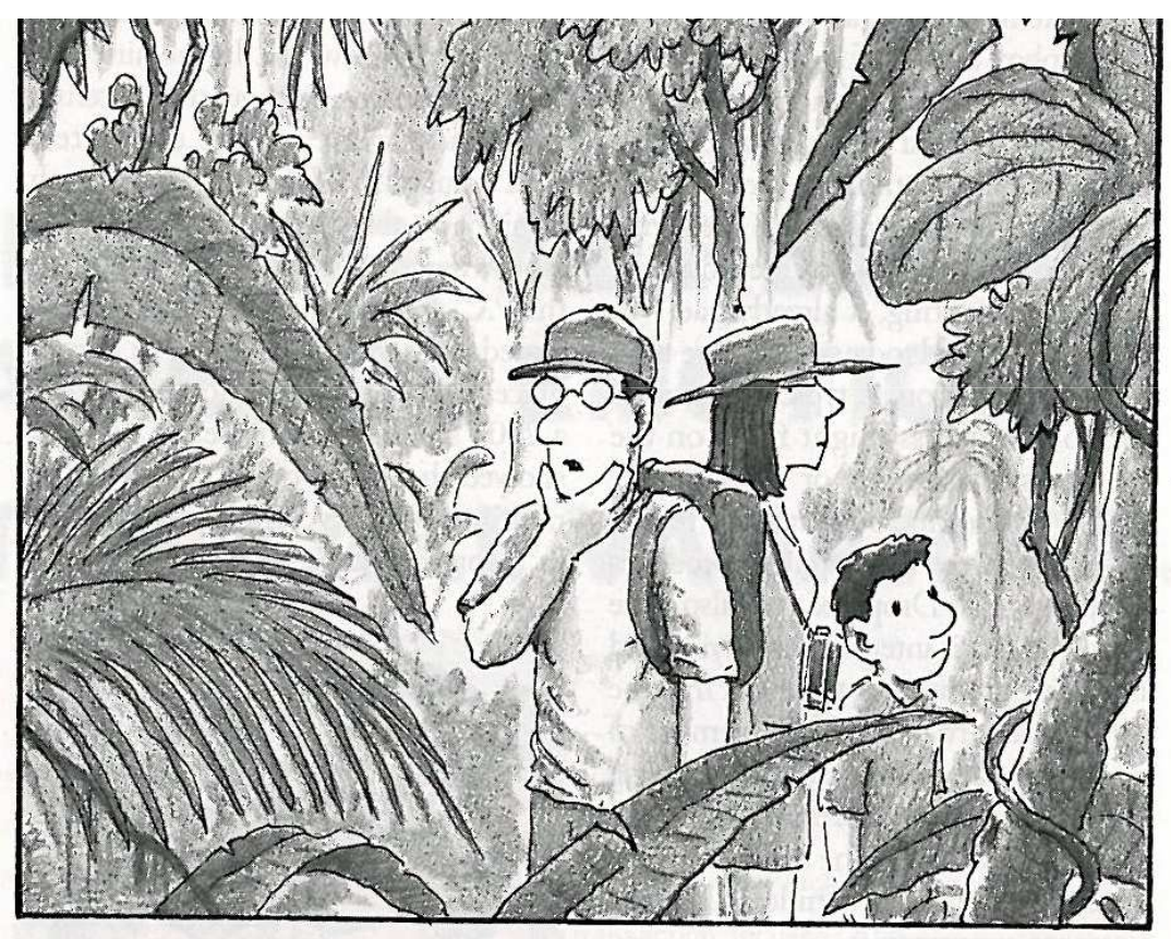
"O.K., I admit it, we're lost, but the important thing is to remain focussed on whose fault it is."

It's no one's fault; it will take all of us to change it.